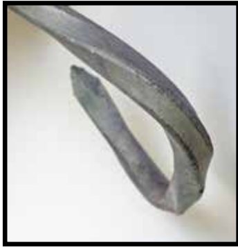
Genuine Tree Island Steel Hot-Dipped Galvanized ZincGard® Nail