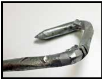
Competitor's Galvanized Nail